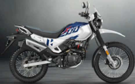
MATTE NEXUS BLUE